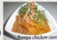
Nonya chicken curry