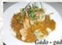
Gado - gado