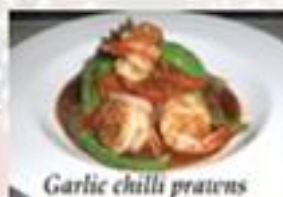
Garlic chilli prawns