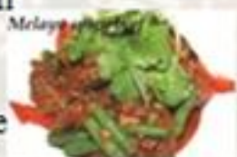
Melayu special beef