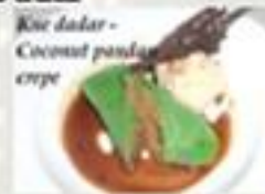
Kue dadar - Coconut pandan crepe