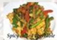
Spicy mixed vegetable