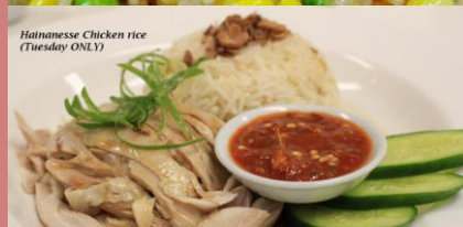
Hainanesse Chicken rice (Tuesday ONLY)