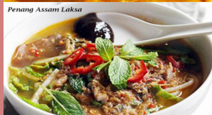
Penang Assam Laksa