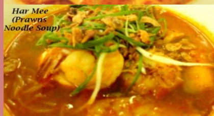
Har Mee (Prawns Noodle Soup)