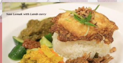
Nasi Lemak with Lamb curry

Egg noodles served in a clear broth, mixture of vegetables and vegetarian dumplings.