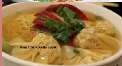
Wan tan Noodle soup