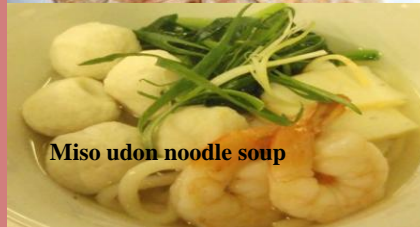
Miso udon noodle soup