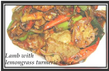
Lamb with lemongrass turmeric sauce