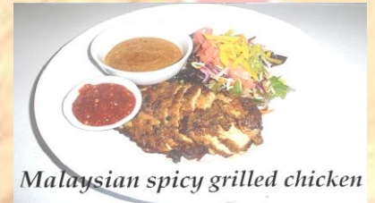
Malaysian spicy grilled chicken