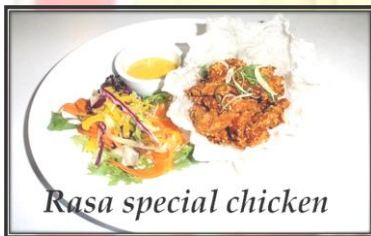
Rasa special chicken