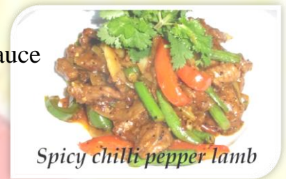
Spicy chilli pepper lamb