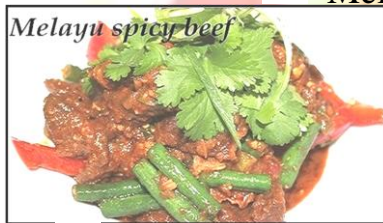
Melayu spicy beef