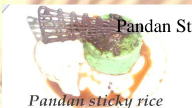
Pandan sticky rice